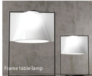
Frame table lamp