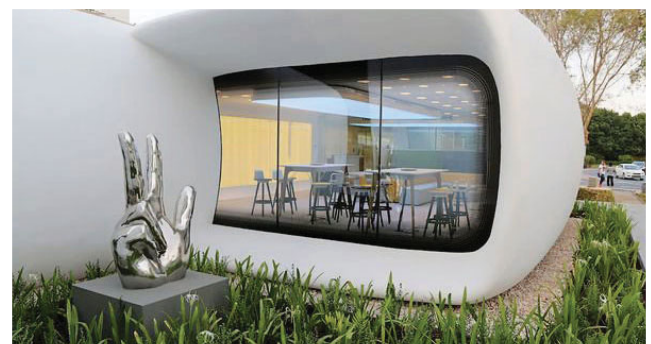
Office of the future: 3D-printed building in Dubai